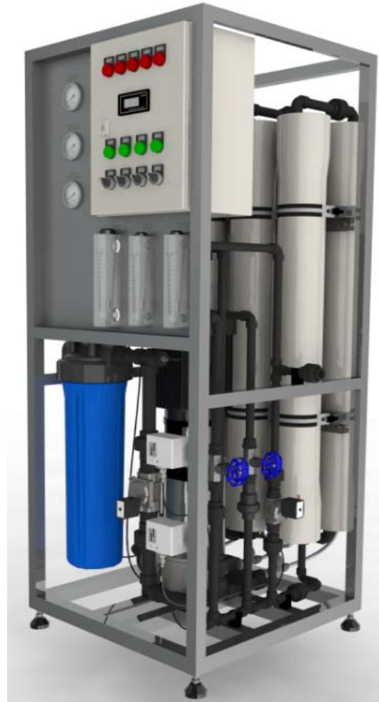
LPRO-B16-9000 Reverse Osmosis System