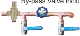
By-pass Valve included