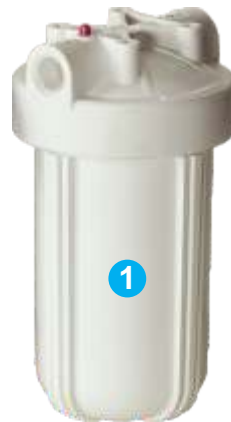
10" Big Blue Housing with 5 micron sediment filter