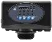
Optional automatic backwash valve